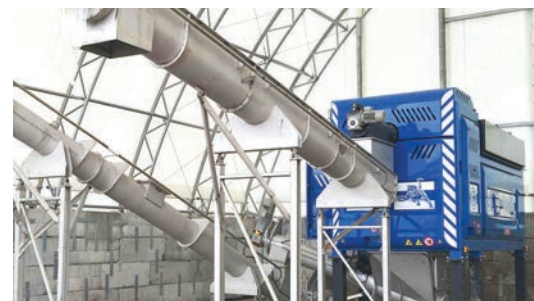
Instantly change between wet or dry organic discharge with programmable water content.