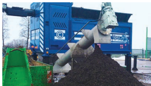
A high-speed vertical mill with bolt-on paddles extracts organics via centrifugal force.