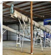
dual organic discharge