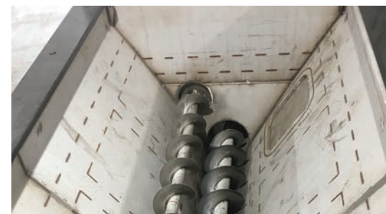
Stainless-steel construction ensures cleanliness, low maintenance, no rust and a long life span.

Regulations are constantly increasing and landfill diversion strategies are becoming mandated. In the search for solutions, the Tiger Depack System delivers an easy, efficient and cost-effective solution for managing multiple volumes of food and organic waste on a compact footprint.