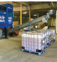
dry organic discharge