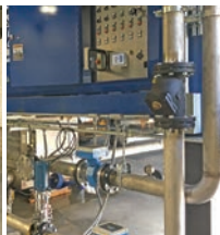
wet organic discharge