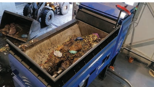
Feed, separate, process and extract organic and inorganic material in a single pass.