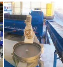
conveyors and auger