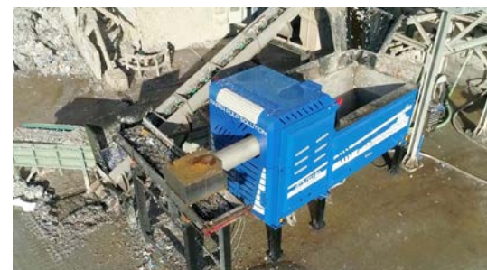
Fully integrated unit requires only a small, compact footprint to fit in most workspaces.