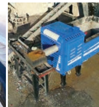
paper pulp recovery