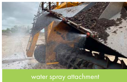
water spray attachment