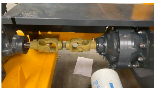
Radial Torque Limiter