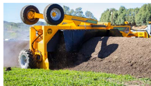
Self propelled drive