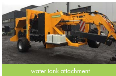
water tank attachment