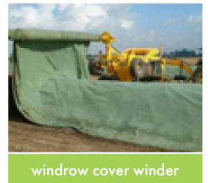
windrow cover winder