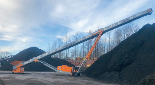
Satisfy any material handling need with models ranging in length from 50' to as long as 150'.