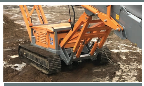
Heavy-duty tracks allow the conveyors to maneuver over rough and muddy terrain.