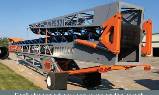
Easily transport any conveyor on the street with an optional road-legal package.