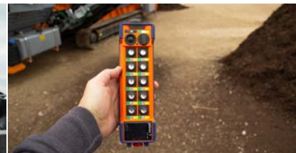
wireless remote control