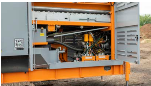
Swing-out doors on all sides of machine allow for easy access to the engine and other internal parts.

Various additional options are available for installation, including a hydraulic stone grid (with slide), a permanent drum magnet with chute, wireless remote control, optional outer (from 1/12 – 3 in.) and inner (from 1/12 – 3 in.) screens, hydraulic support feet, operation lighting, and more.