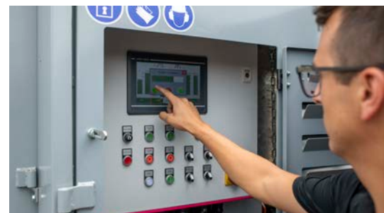
User-friendly, 10-inch control panel tracks machine data and operates machine.