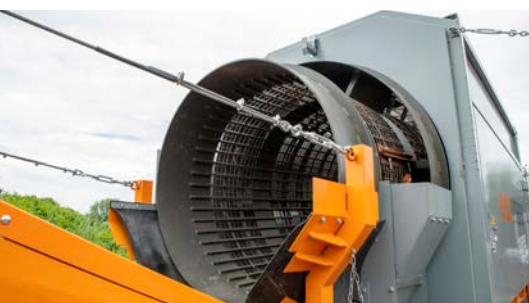
The outer screen filters out mids & fines, while the heavy-duty inner drum handles overs.