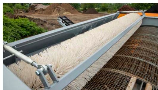
A motorized brush spins in the opposite direction for exceptional cleaning.