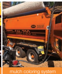
mulch coloring system