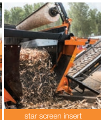
star screen insert