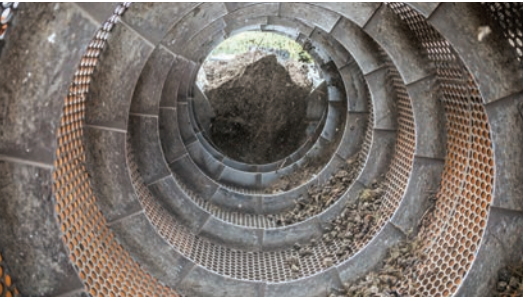
The laser-cut, auger-style drum design provides best-in-class open screening area.