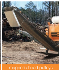
magnetic head pulleys