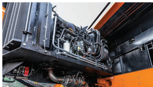
The entire engine unit swings out 90° from the machine for convenient maintenance access.