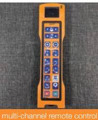
multi-channel remote control