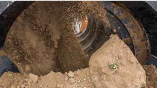
Auto load sensing varies the material flow from the hopper to consistently maintain peak output.