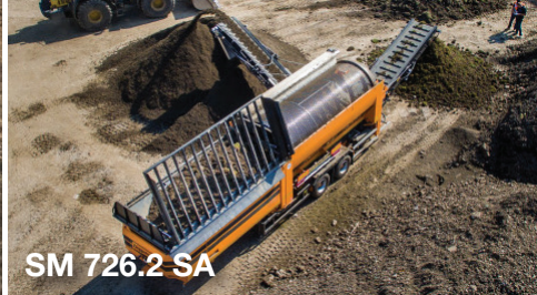
SM 726.2 SA