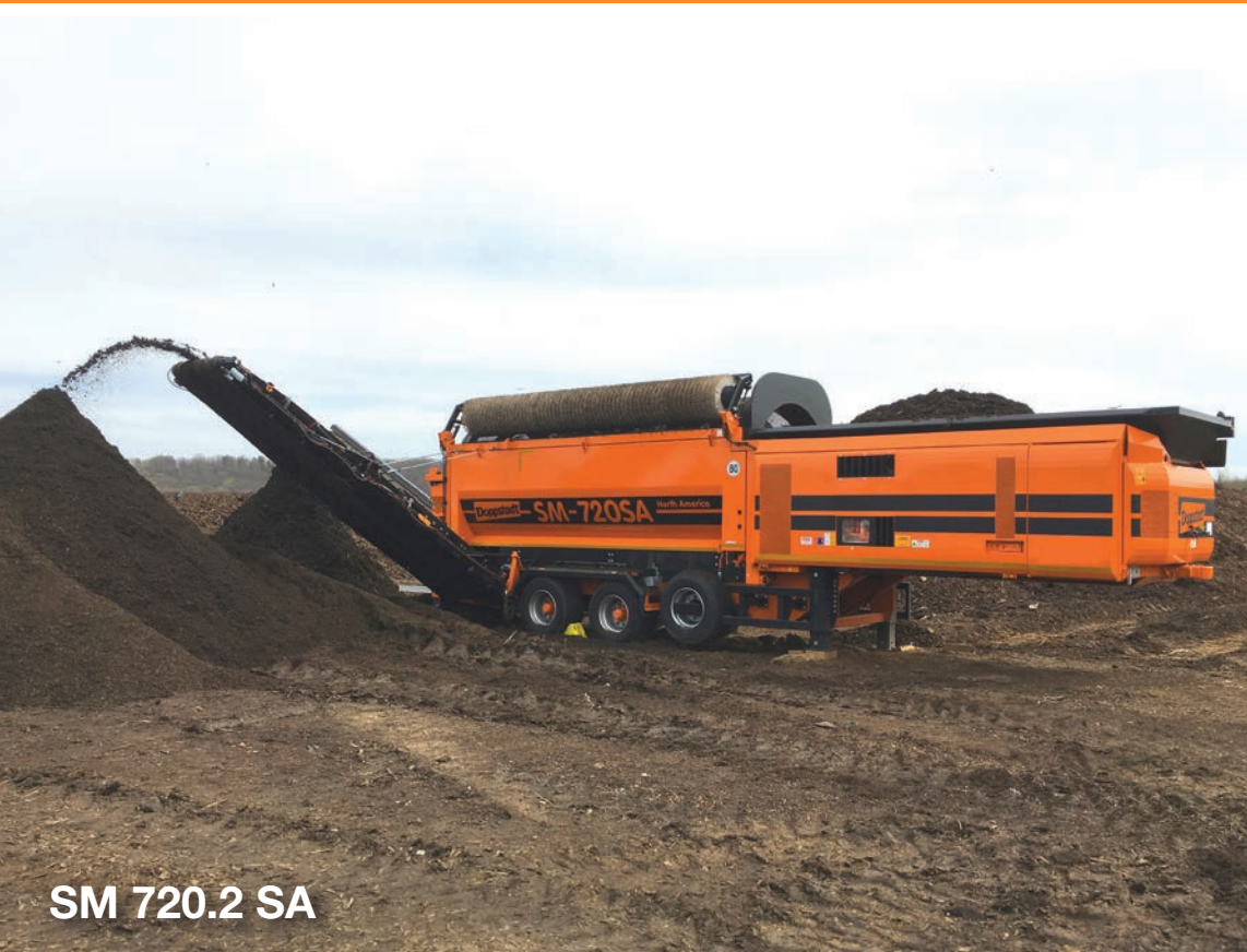
SM 720.2 SA

Doppstadt trommels are North America's #1 brand for good reason — they feature precision engineering, high-quality components and incredible efficiency. These benefits make any screening job easier while still lowering your cost of throughput and material production.