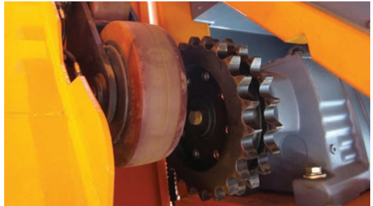
The trommel drum is driven by a double chain and sprocket that delivers exceptional torque.