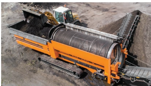
An optional 9.6 yd 3 hopper offers a low feed height and is driven by twin gear drives.

Regardless of your application, the SM Series trommels from Doppstadt can be run at peak performance by a single operator. Maximize your efficiency and reduce your overall production costs with Doppstadt.