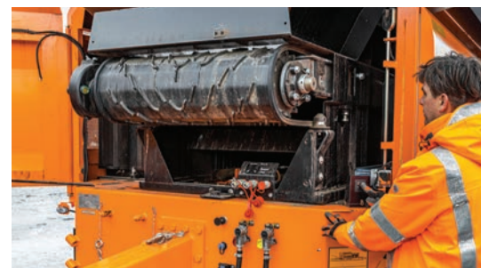
True modular construction allows easy access for operators and technicians.