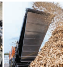
magnetic head pulley