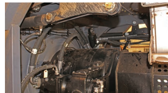
The VarioDirect drive allows the shaft to increase torque, reverse and start under load.

Doppstadt high-torque shredders have the perfect combination of power and efficiency. Pack more material in each load from a site-clearing project. Fit more waste into every cubic yard of landfill space. Prep organics to create the perfect windrow structure. If you need to reduce costs through a primary volume-reduction process, Doppstadt high-torque shredders are the right machines for the job.