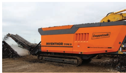
Even the messiest landfills and compost sites are no match for Doppstadt's tracked chassis.