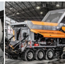
LED lighting system