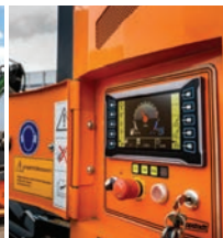
telematic monitoring system