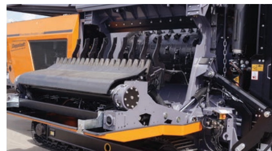
Fold-out components and wide interior access make Doppstadt a favorite of technicians.