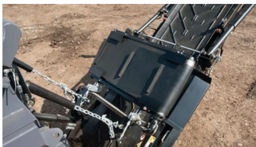
Recover metals and protect secondary processing equipment with a powerful neodymium magnet.