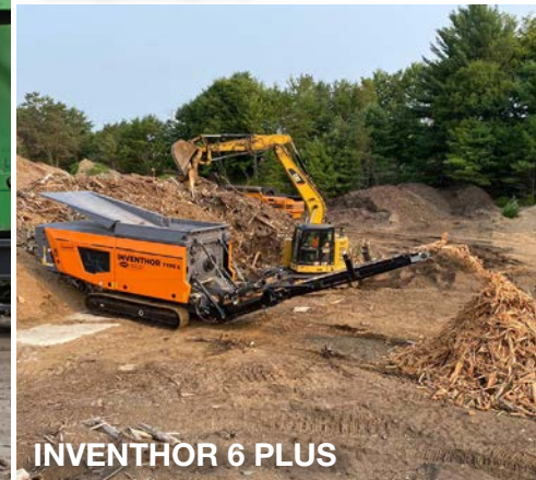
INVENTHOR 6 PLUS