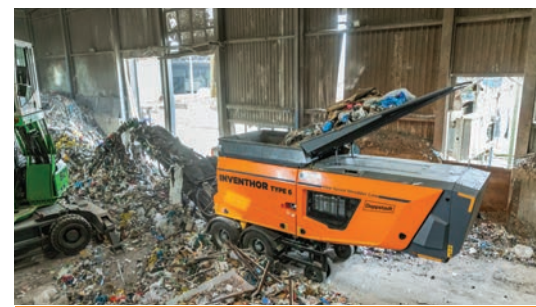
A hydraulically activated tipping hopper allows smart and efficient material feeding to the shaft.