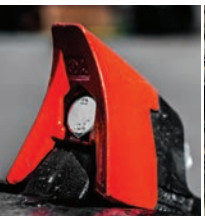
multiple tooth configurations