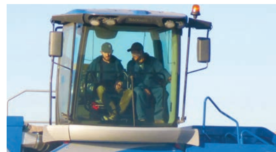
The industry's largest cabin provides the operator with a 360° view of the site.