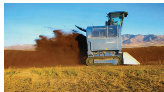
Independently controlled track clearers guide material to the drum and "float" to fit any pad.