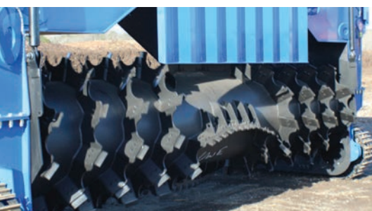
Large diameter drum maximizes homogenization and oxygenation of the windrow material.