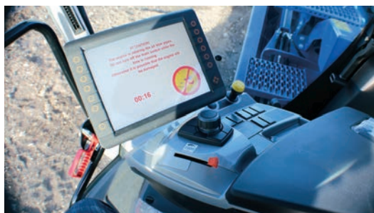
The single-joystick control, load-sensing and touchscreen display make for easy operation.