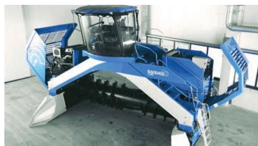
A fold-out work platform gives technicians clear access to the machine's components.