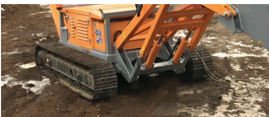
Self-diagnostic CAN bus system provides real-time feedback and alarms displayed in text format.

Regardless of the feedstock, the A75 sets new standards in power, performance, efficiency and handling.