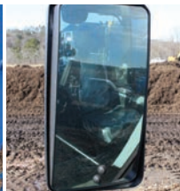
remote heated mirrors